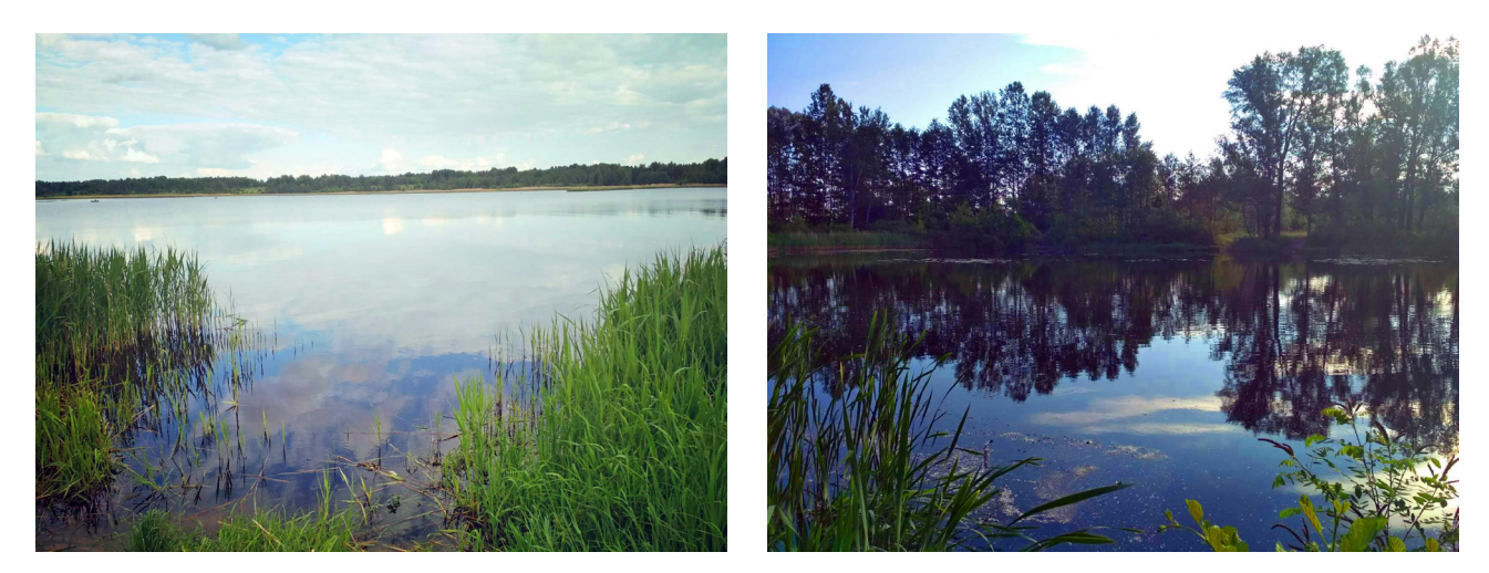
Figs 2–3. Habitats of Planorbarius corneus in 2019: 2 – River Teteriv (village Korchak, Zhytomyr region); 3 – River Vorskla (village Semyanivka, Poltava region).

Taxonomic identification was performed according to the following scheme. First, six individuals from each sample were subject to electrophoresis in 7.5% polyacrylamide gel in Tris-borate-EDTA buffer (ph = 8.5) during 1 h 20 min (200 V, 140 mA) (PEACOCK et al. 1965). The rest of the collected material was identified conchologically. Metric indices were calculated: absolute shell size, indices of the rate of whorl increment and height/width ratio of the aperture. We also considered the colouration and transparency of the conchiolin layer. In doubtful cases we resorted to anatomical features: size of spermatheca reservoir and its ducts and the related indices (MEZHZHERIN et al. 2005). In total, we identified 207 individuals as the "western" and 168 individuals as the "eastern" allospecies.