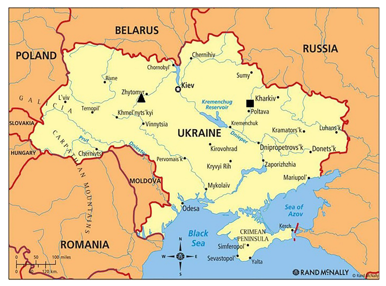
Fig. 1. Map showing the type localities of Planorbarius corneus sensu lato: black triangle – "western"; black square – "eastern" allospecies

The main method used was hand-collecting from the surface of water plants, river bottom and artificial materials (e.g. plastic bottles and bags) combined with washing the sediment on a metal sieve (diameter 20 cm, 2 cm mesh).